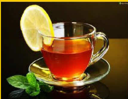
Tea with lemon